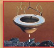
Drip and Evaporation

Choose from four options to regulate the aroma intensity.